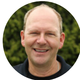
Henry Bremer Dairy