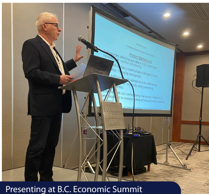
Presenting at B.C. Economic Summit April 2024

CFA lobby the federal government to provide federal government funding that supports efforts by industry associations to engage with Indigenous Peoples on policy development and program design.