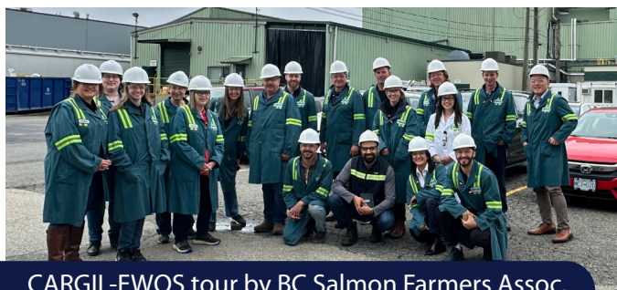
CARGIL-EWOS tour by BC Salmon Farmers Assoc. June 2024