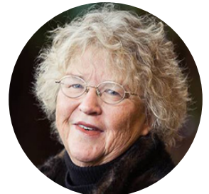
Lynda Atkinson Equine