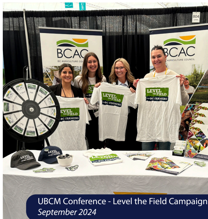
UBCM Conference - Level the Field Campaign September 2024

In addition to having a booth at the trade show, BCAC participated in two panels on water and emergency preparedness, further establishing its role in shaping municipal policies impacting agriculture. This coincided with our front-page op-ed on drought and water security in the Vancouver Sun .