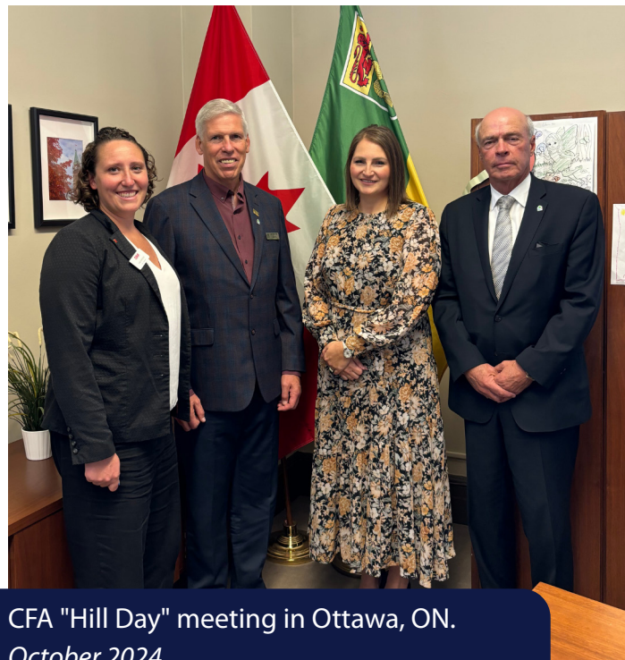
CFA "Hill Day" meeting in Ottawa, ON. October 2024

More so than in previous years, BCAC was also called upon to provide input on programming and administrative processes. For example, BCAC staff contributed to the rapid development of program eligibility criteria under the expanded Agricultural Water Infrastructure Program, as well as a detailed proposal for a Premier's Task Force on Agri-Food Competitiveness and Growth.