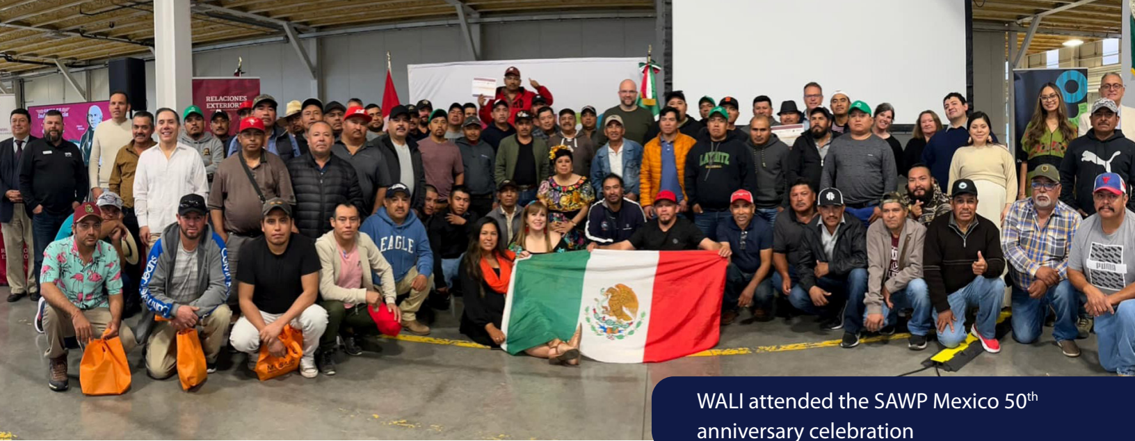
WALI attended the SAWP Mexico 50 th anniversary celebration