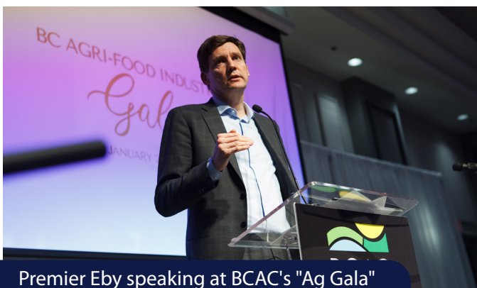
Premier Eby speaking at BCAC's "Ag Gala" January 2024

BCAC has continued to strengthen key relationships with both provincial and federal governments, enhancing its role as a trusted partner in policy development.