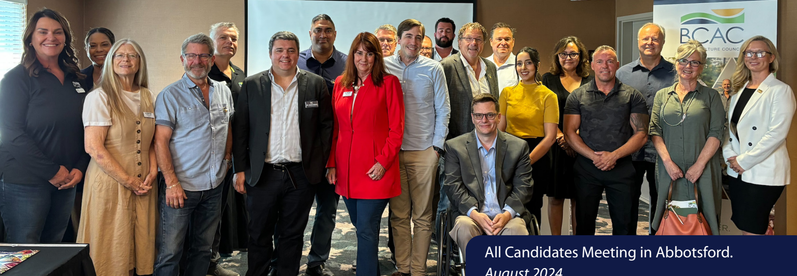
All Candidates Meeting in Abbotsford. August 2024

messages directly from farmers. These meetings were well-received, with candidates expressing appreciation for the engaging and informative discussions.